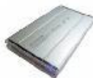
2.5" SATA/IDE USB2.0 Caddle USB-HD2.5SI