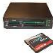
3.5" MediaCard Reader USB-ALL-INT